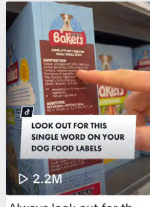
Always look out for th...